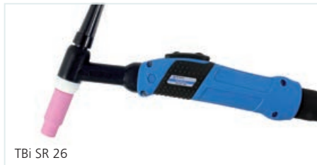
TBi SR 26

wassergekühlt / water cooled / refroidissement par eau 100% (10 min.) AC: 225 A DC: 320 A Ø 0.5-4.0 mm