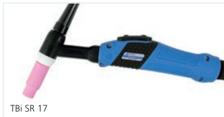
TBi SR 17